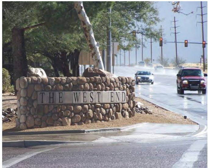
West End entryway monument walls

Redevelopment and infill opportunities exist within the City’s current urban boundaries; however, infill and redevelopment are primarily focused in the older areas of the City such as the City’s West End. The City recognizes the importance of redeveloping dilapidated or underused buildings and encourages infill development projects where existing infrastructure is already developed or will be improved by new development. Redevelopment often removes blighted, vacant, or underused buildings and infill development uses vacant parcels of land in developed areas using existing infrastructure, such as roads and sewer lines. Infill development avoids extending infrastructure that requires additional public resources for maintenance.